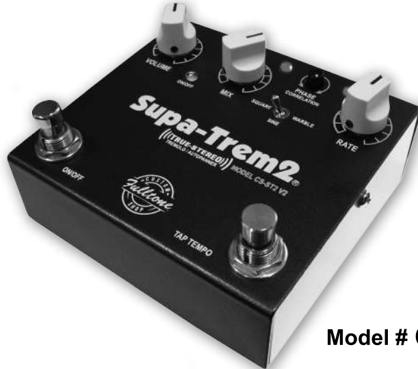
Model # CS-ST2 v2

The original mono Supa-Trem 1 was an extremely successful pedal for me ever since it came out in 1998. The key to its great sound is due to the use of an Analog Devices brand JFET operational amplifier at its heart. Another ingredient to its success is my use of proprietary Optocouplers that I designed, and that are made exclusively for Fulltone. These Optocouplers have the optimal resistance range as well as the fastest rise and fall times available, allowing for rich tremolo performance at all speeds...not just the slower speeds.